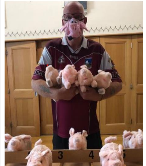
From the Live stream

We collected funds on the night with our members buying pigs covering the amount we sent to RC of Minster for their charity having lots of fun, tapas and wine - a good night enjoyed by all.