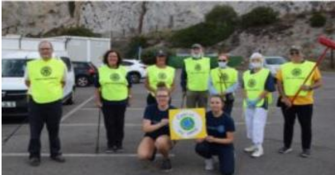
19 September 2020 – Clean up the World Members join Interact to clean up Little Bay